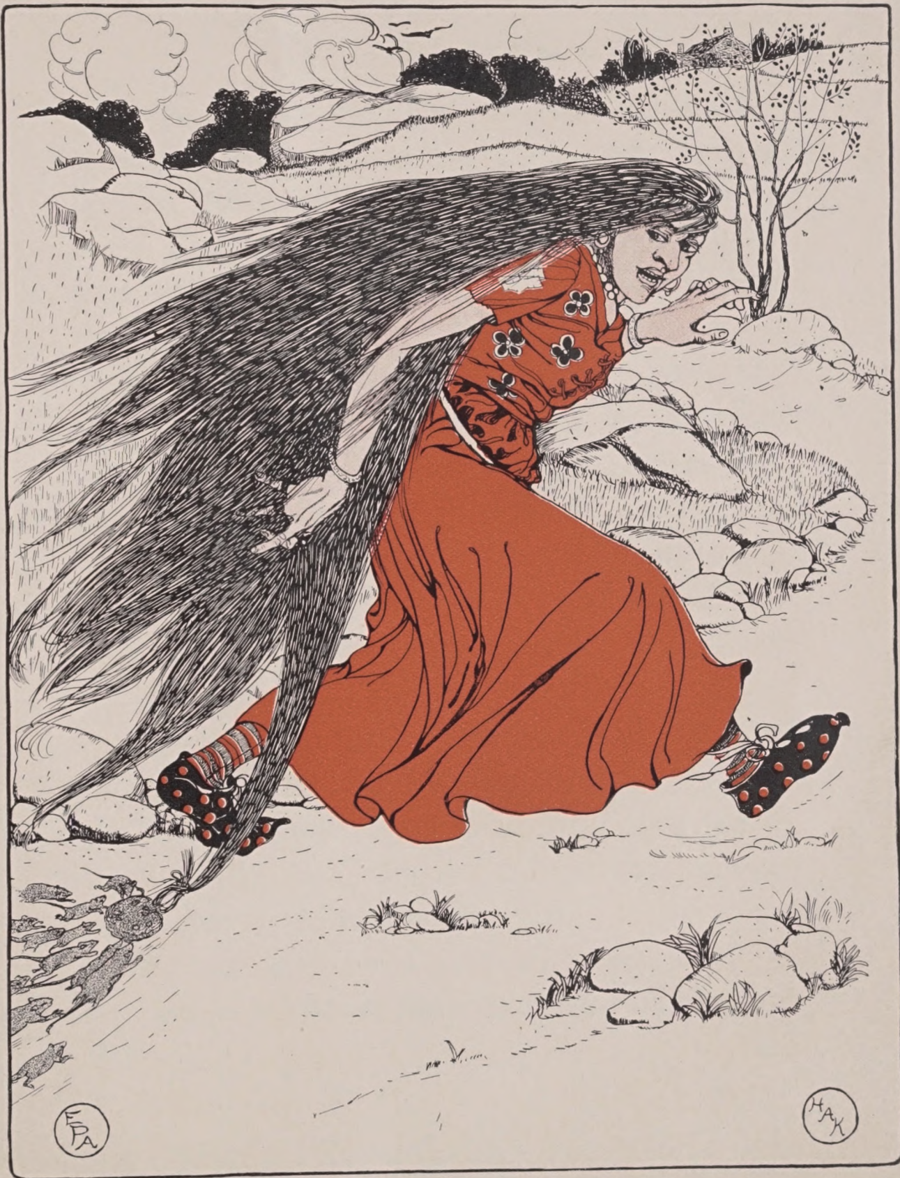
SCREAMING AND SHRIEKING, SHE RACED DOWN THE ROAD